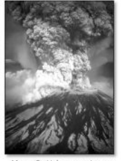
Mount St. Helens erupting on May 18, 1980.

Since then, scientists have studied the blast zone to see how plants and animals slowly return after a major natural disaster. New lakes, meadows, and young forests now fill the area, offering a living classroom on how landscapes recover and how volcanoes shape the Pacific Northwest.