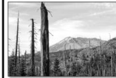
Twenty years after the eruption, a mix of dead trees and new vegetation shows how the land is slowly recovering.