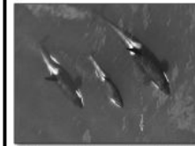
Southern resident orcas chase Chinook salmon, their main source of food in the Salish Sea.