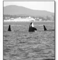
Orcas playing can be easily spotted in the waters just off shore.

Today, scientists, wildlife groups, fishermen, and tribal nations work together to restore salmon streams, monitor whale health, and protect feeding areas. Programs limit vessel traffic near orcas and encourage people to buy sustainable seafood. The effort to protect orcas shows how ocean life and human actions are closely linked in the Pacific Northwest.